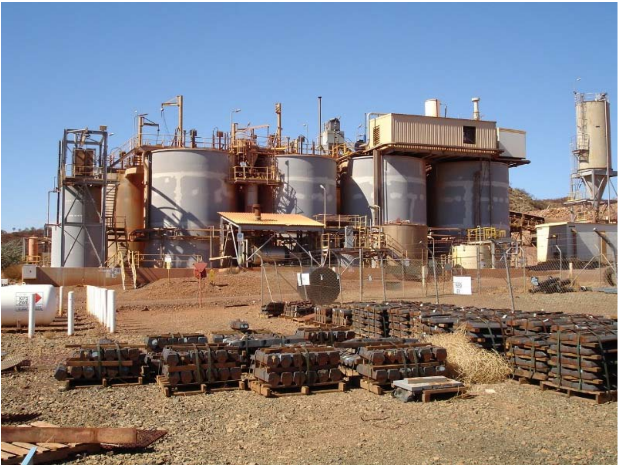
Figure 2 – The Mount Olympus Gold Processing Plant purchased by the Company showing tanks and mill liners.