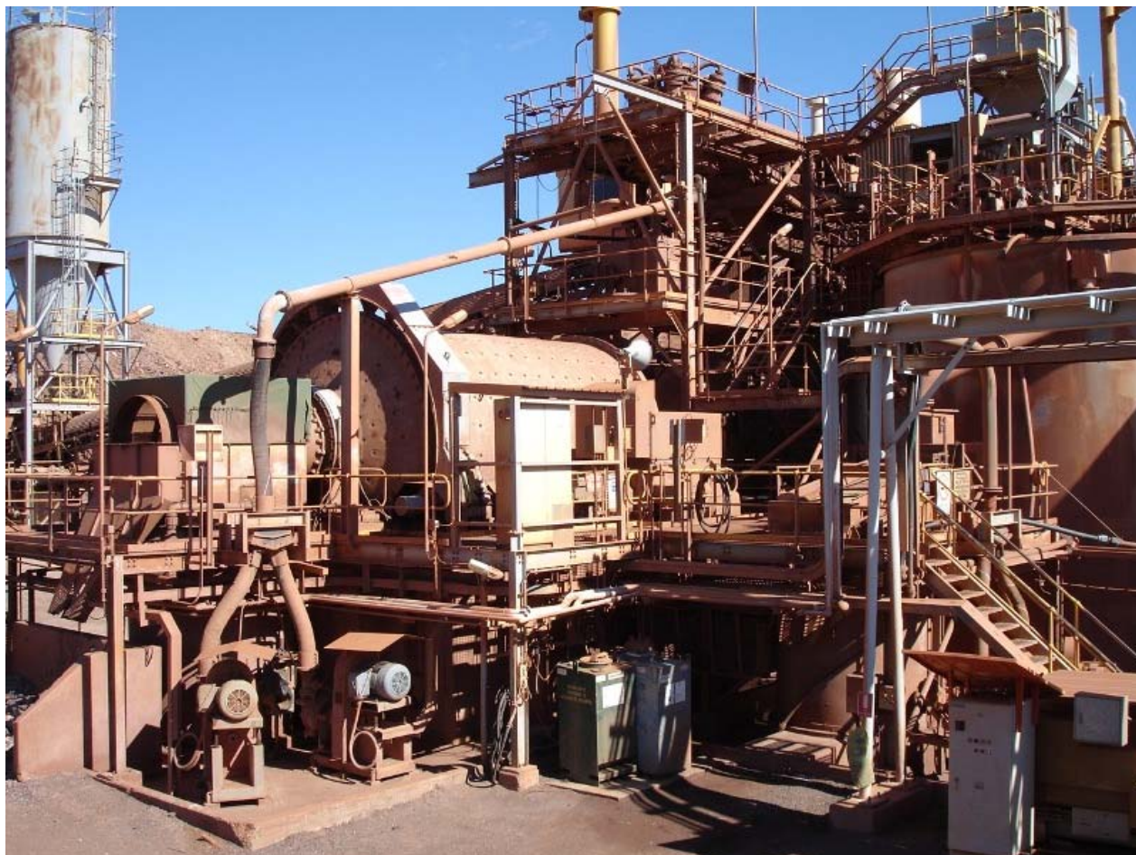
Figure 1 – The Mount Olympus Gold Processing Plant purchased by the Company showing the ball mill prior to relocation to Indonesia

Engineering work associated with the dismantling, transportation, re-erection and modifications (including the addition of an elution circuit, detox unit, gold room and backfill plant) have commenced and are on schedule.